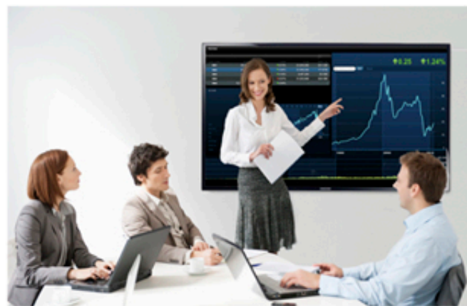
Figure 1. ME95C can replace conventional projector in meeting room environment.

Samsung ME95C LED LFD deliver high-quality images without the distortion, blur or glare inherent in traditional projectors, providing productive, distraction-free presentations. An ultra-clear panel, backlight dimming and a 120 Hz refresh rate help enhance image detail and readability, providing a better viewing experience.