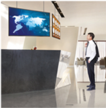
Figure 2. Samsung MagicInfo™ S all-in-one display solution includes an internal media player and signage software.

Three PIM options are available to suit specific needs.