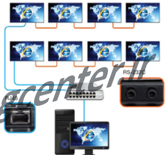
Figure 4. Samsung ME95C LED displays enable RJ45 and RS-232 connectivity simultaneously.

Samsung ME95C LED displays offer powerful connectivity, even when working with RJ45 and RS-232 connections. Competitor displays can operate only an RJ45 or RS-232 connection. With the Samsung line of LED displays, both network connections can be used simultaneously. Using a DP 1.2 loop out, a single display image can be shared with nearby displays. This feature eliminates the need to purchase separate video signal distributors for each display, further reducing equipment costs.