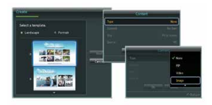
Figure 2. Users can quickly and easily develop content with the user-friendly MagicInfo S interface.

With MagicInfo Premium S, users can take advantage of pre-loaded templates to quickly create content. The pre-loaded templates can be edited with the embedded Template Manager. With Template Manager, customized content can be created in just a few minutes by entering text and selecting a content source to play from either internal memory or a USB drive. Up to two video sources can be supported in a template through the embedded Template Manager, allowing for a dynamic presentation of important information. This flexibility allows for the development of a broad range of custom content to match specific marketing messages.