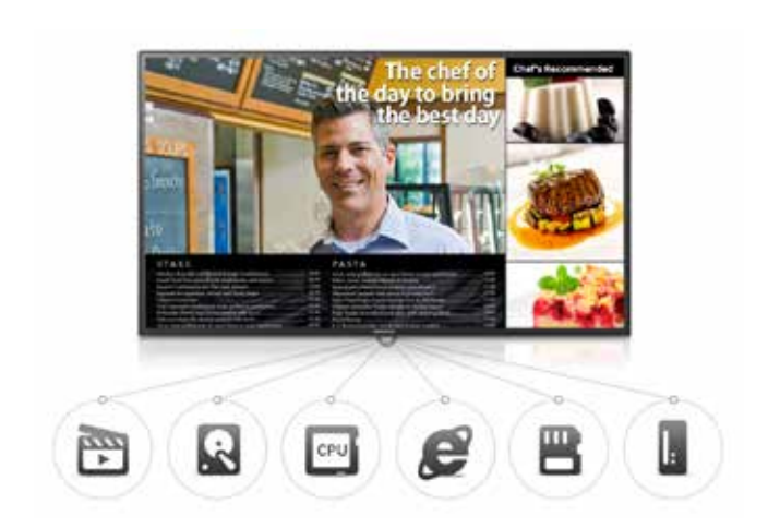
Figure 1. MagicInfo S is embedded directly on the LFD's SoC.

MagicInfo Premium S supports content play and remote management both with and without network connection. For digital signage without network connection, users can simply display port media files on a USB drive, plug the USB drive into the LFD, and then watch the content play on the LFD. With the embedded solution and USB drive Auto Play, users can begin developing and displaying dynamic content right out of the box. It also supports various video and audio codecs without additional external media player required.